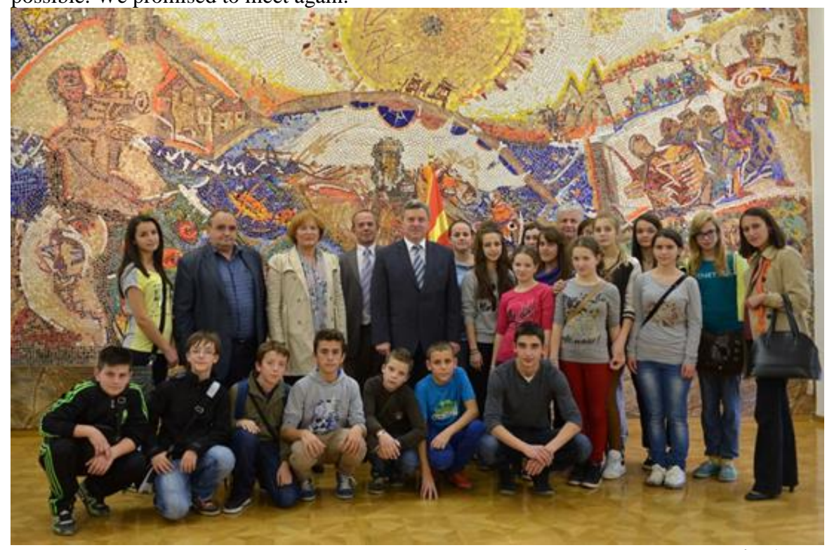
Visit at the president of the Republic of Macedonia