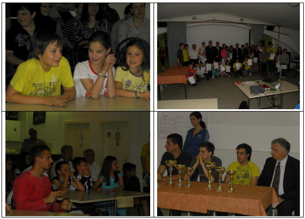
Impressions from the traditional competition in knowledge in Kranj in 2009

for years as part of the "May Days of Macedonian Culture" event by the "Saint Cyril and Methodius" Macedonian Culture Society from Kranj. Since these days fall on the same week as Saint Cyril Day, 24 May, the timing is right for holding a competition in knowledge.