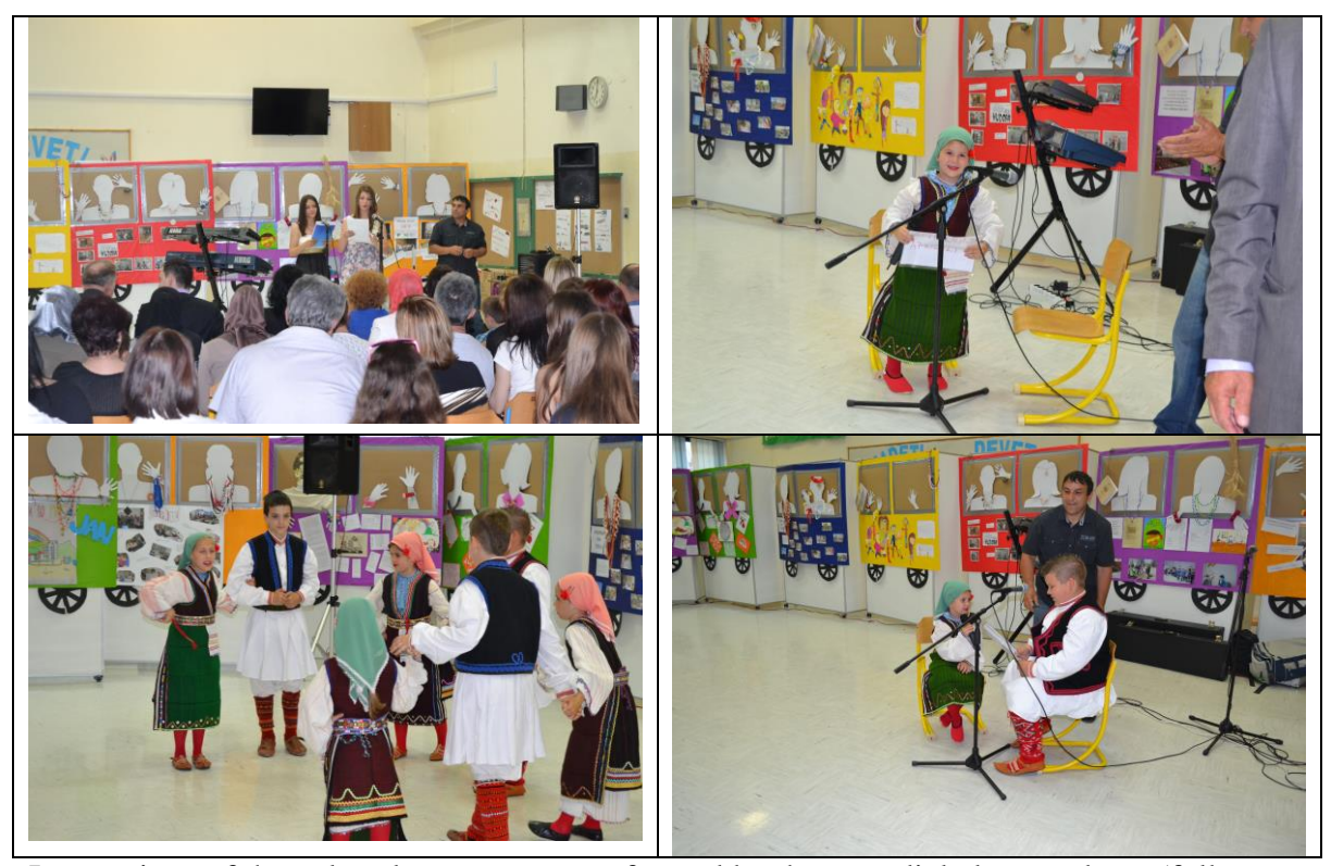
Impressions of the cultural programme performed by the remedial class students (folk dance from Kranj, students from all the schools in the rest of the program) – 14 June 2014 Dragomir Benčič – Brkin Elementary School