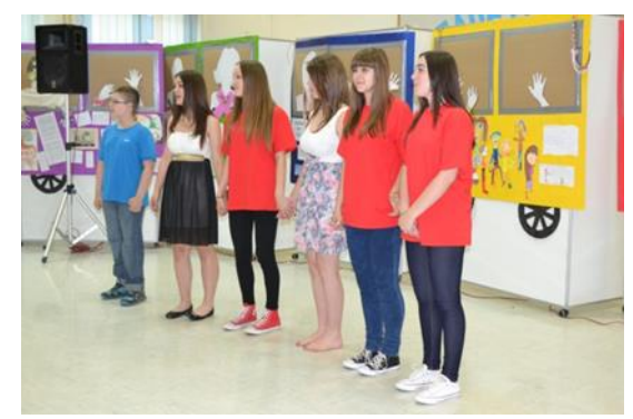
Our ballerinas present themselves.